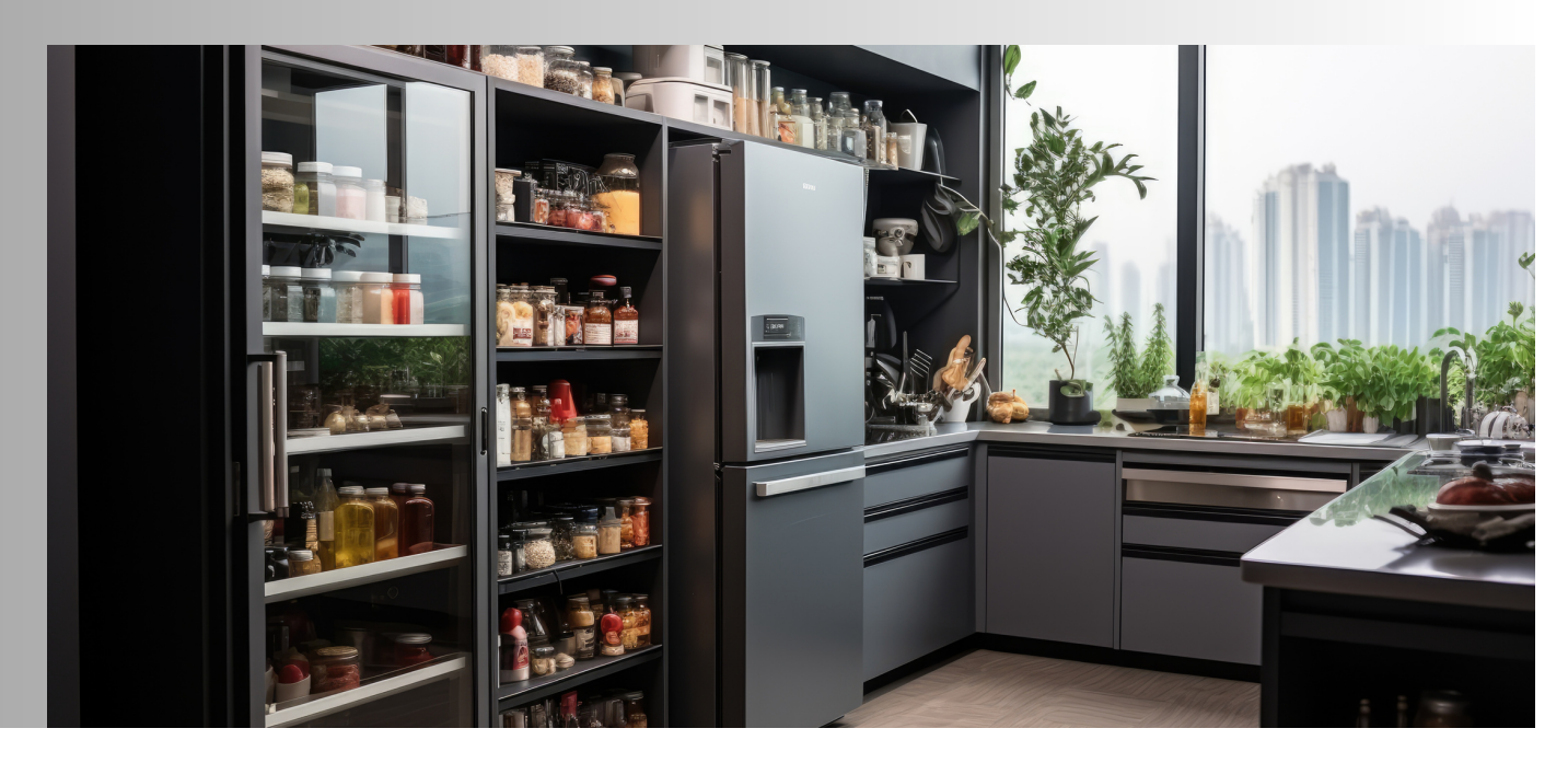
5 of 50: Glass-Front Food Storage

The Glass-Front Food Storage kitchen style combines functionality with aesthetic appeal, offering a chic and organized solution for modern kitchens. This design emphasizes visibility and accessibility, making it perfect for those who appreciate both form and function.